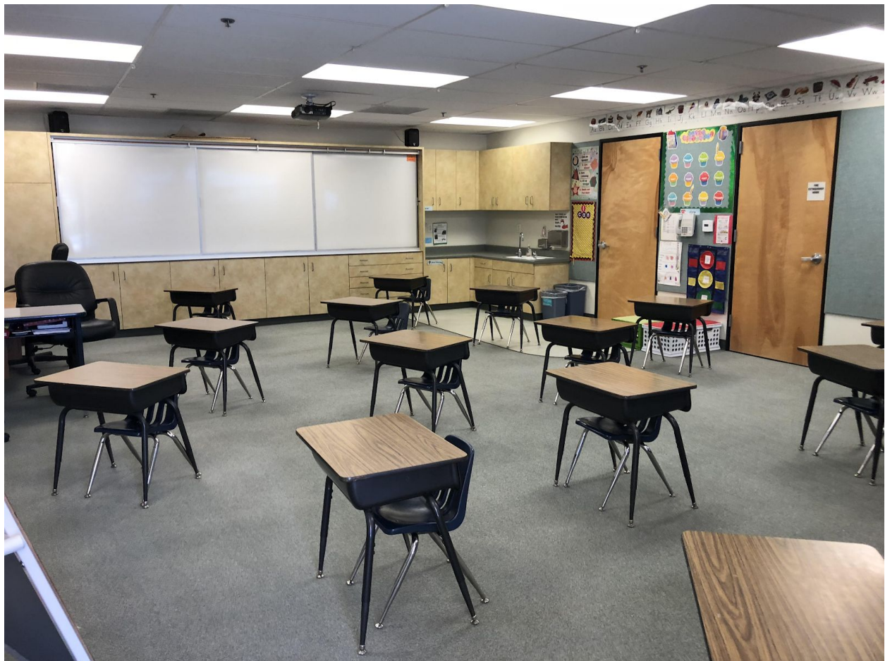
Fig 3. The Kindergarten Classroom, Desks Situated so Students Are at Least Six Feet Apart

Pictures of representative classrooms are in Figures 3-5 below. Desks in each room are situated so each student will be at least six feet from their nearest neighbor. The Kindergarten room ( Figure 3 ) is representative of classrooms on the first floor of Canterbury Hall, our main building. Grades K-2 have classrooms on the first floor of Canterbury Hall. The fifth grade room ( Figure 4 ) is representative of classrooms on the second floor of Canterbury Hall, our main building. Grades 3-5 have classrooms on the second floor of Canterbury Hall. The sixth grade room ( Figure 5 ) is in a separate building, adjacent to Canterbury Hall; as noted above, we only have eight students enrolled in sixth grade. In each classroom picture, the built-in sink is visible.